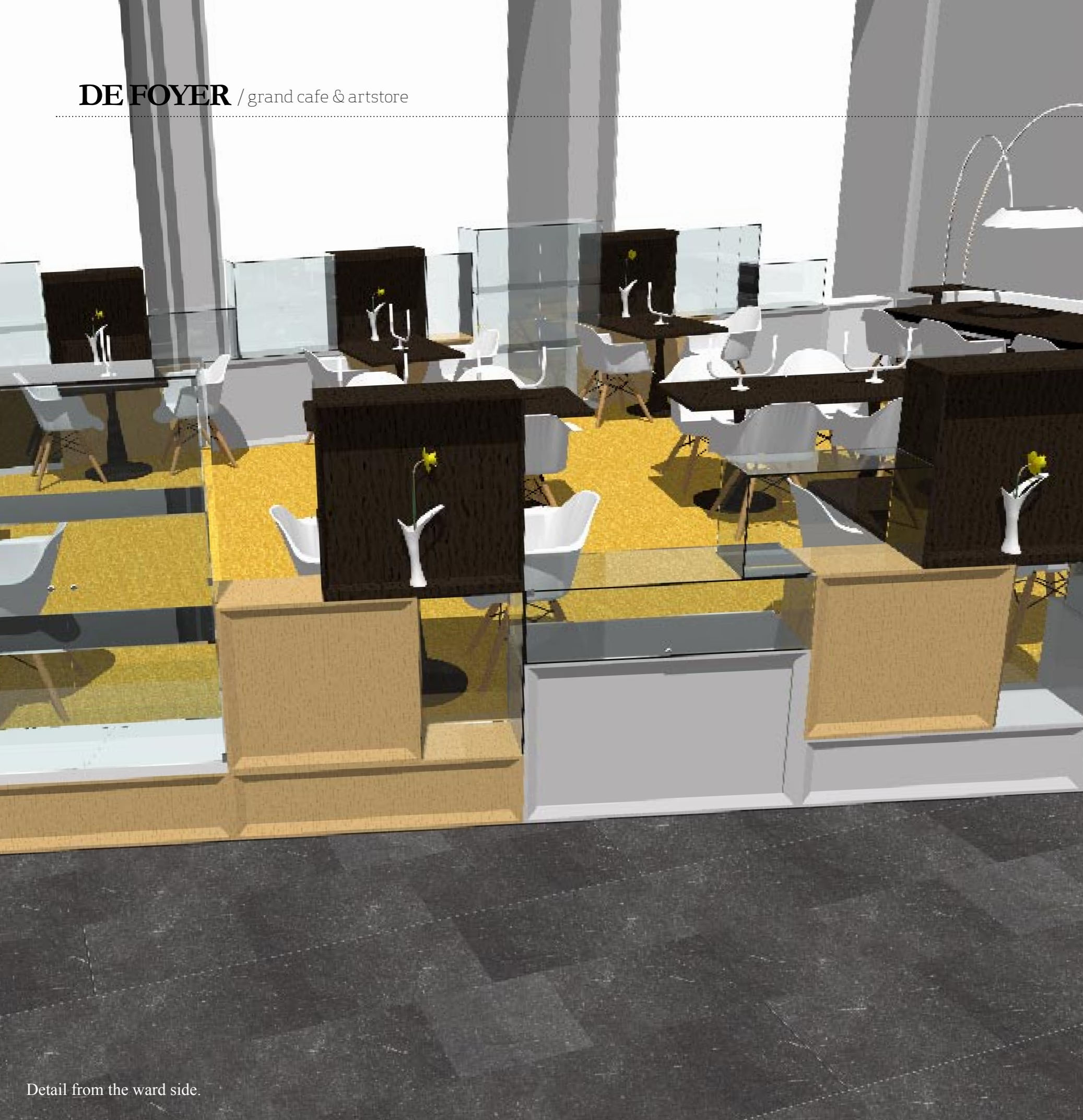
Detail from the ward side.